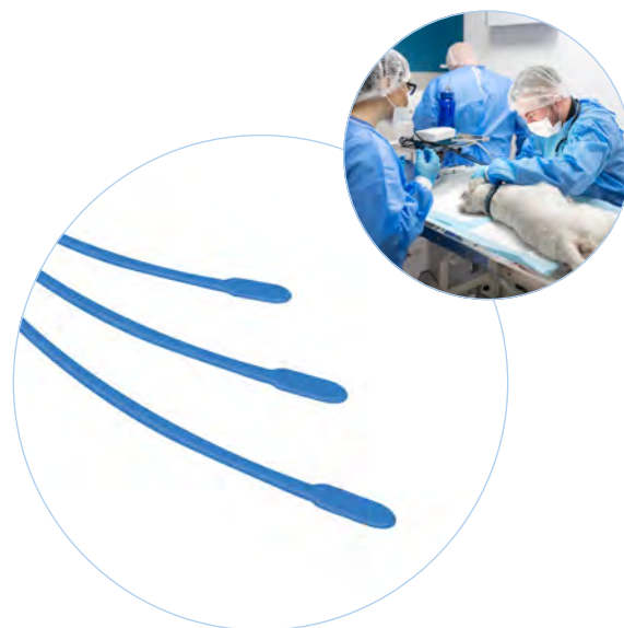
Probes for esophageal, rectal and nasal temperature measurement