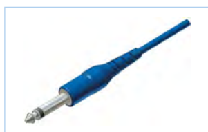
Phone plug straight